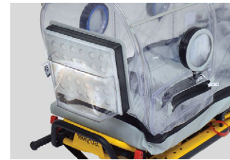
Air inlet cover allows to protect the filter