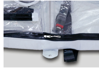
Chamber base with high lip for better fluid holding

The IsoArk N 36-4H has four integrated zipped glove portals on each side for internal working access while the chamber is closed, and several small zipped portals integrated into the liner, which can be used for infusions, catheter equipment, etc. When not in use, the entire system can be easily dismantled and folded for very compact storage.