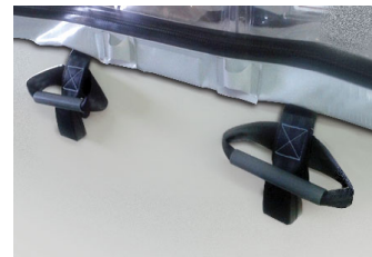
Lifting handles in the base of the chamber